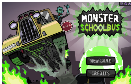
Monster School Bus can be found at www.mathsnacks.org